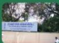
THE LAKSHMI MILLS COMPANY LTD., COIMBATORE