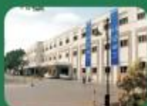
G.KUPPUSWAMY NAIDU INSTITUTE OF NURSING, COIMBATORE