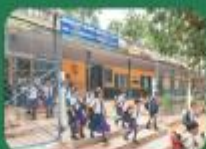
LAKSHMI MILLS HIGHER SECONDARY SCHOOL, COIMBATORE