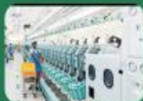
THE LAKSHMI MILLS COMPANY LTD., KOVILPATTI