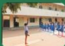
MANI HIGHER SECONDARY SCHOOL, COIMBATORE