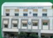
G.KUPPUSWAMY NAIDU MEMORIAL HOSPITAL, COIMBATORE